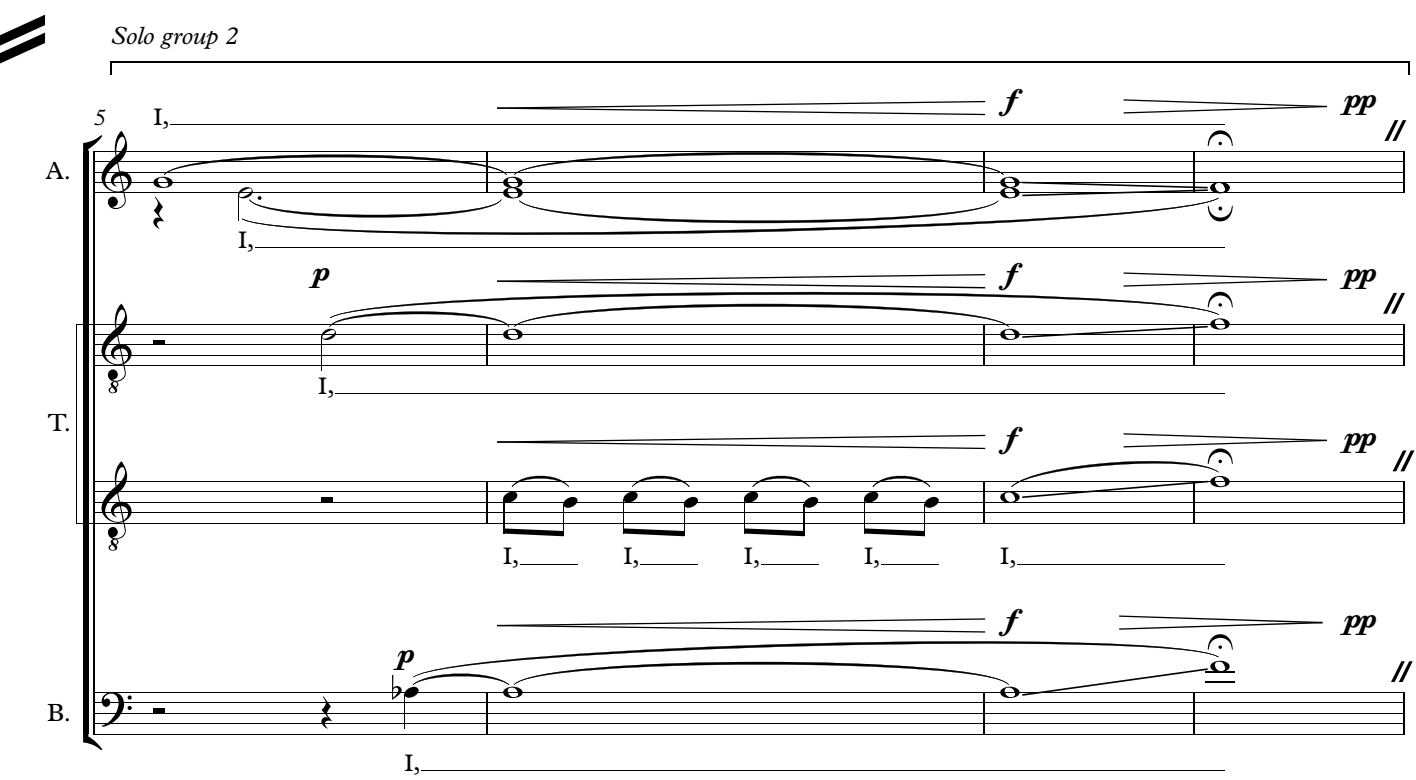
N.B. All metronome markings are approximate